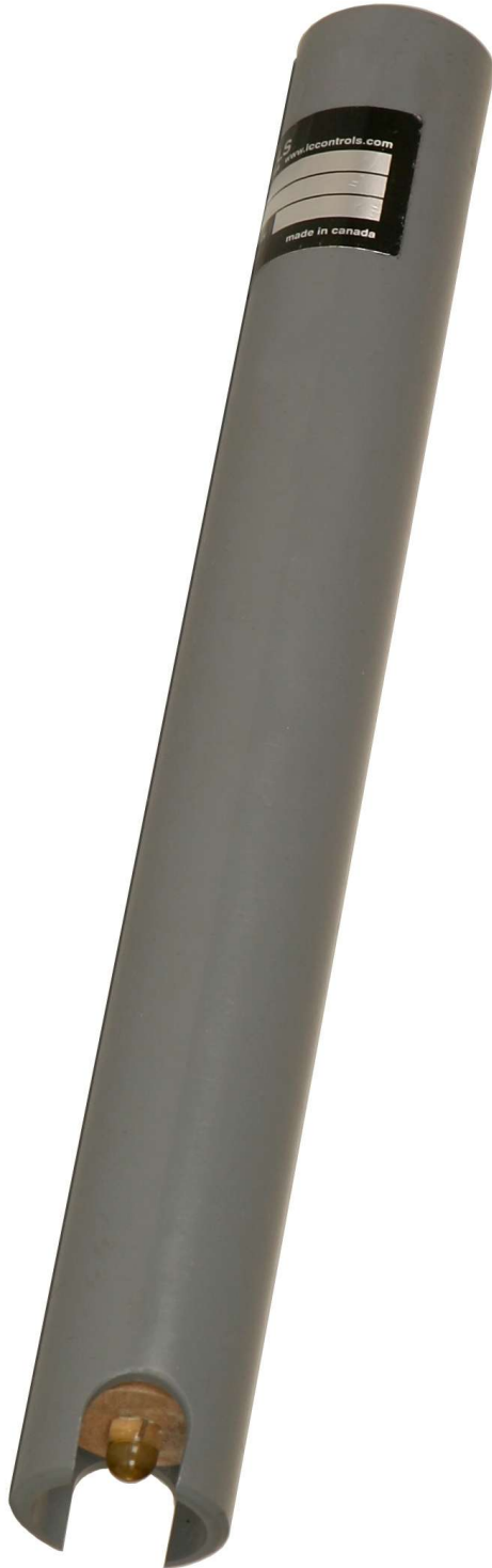
Mounts on 3/4" fnpt pipe (2/3 actual size)