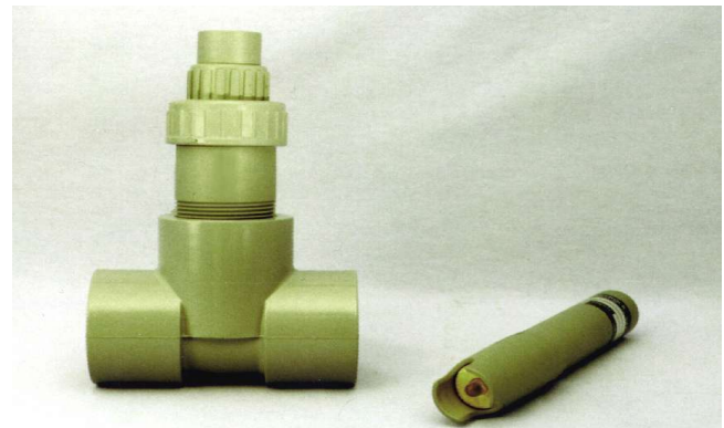
Quick union in-line insertion (1.5" MNPT tee)