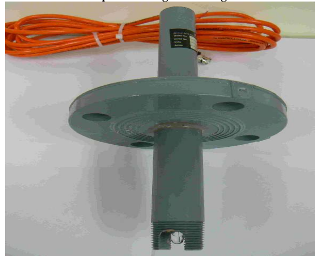
Mounts in 2" flanged pipe tee (1/3 actual size)